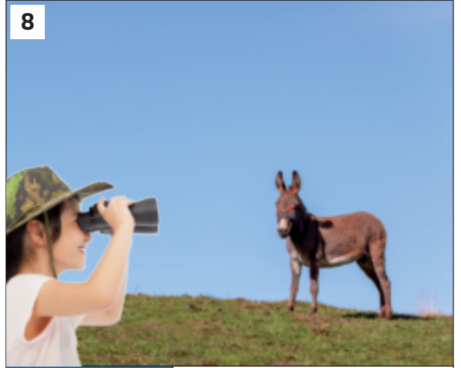
That is a donkey.