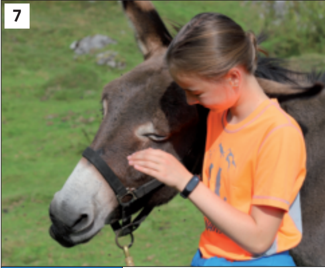
This is a donkey.